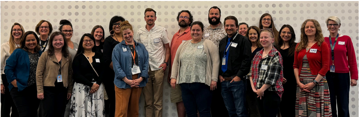
Minneapolis Public Schools (MPS) Academy - Teacher Educator Institute, Kick-Off Retreat Minneapolis, MN (May 2024)