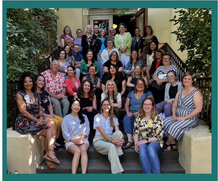
Oregon Teacher Education Institute, Kick Off Retreat - Portland, OR (June, 2024)